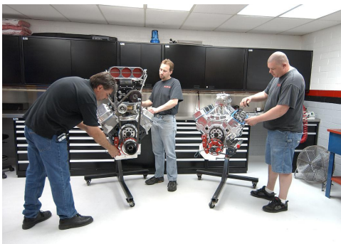
The BRE Staff Assembling Customers' Engines Prior to Dyno Tuning

All of the above are absolutely brand-new parts from vendors that BRE is an authorized reseller of!