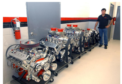
Fully Built and Tuned BRE Engines Ready for Delivery to our Customers